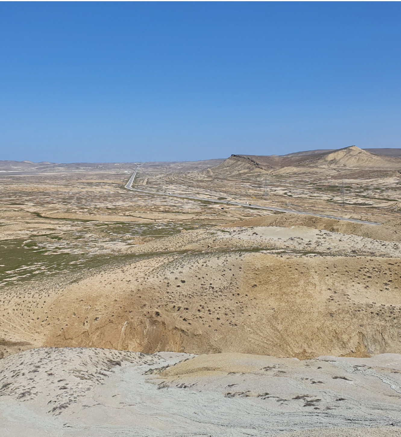
Climate change-induced degraded lands in Qobustan, Azerbaijan. (Rovshan Abbasov.)