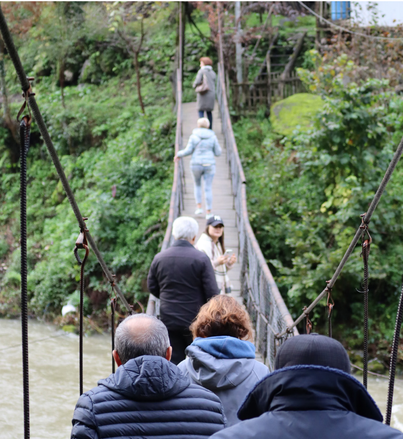
EU4Dialogue Component 1 Dialogue activities bringing technical experts together from across the South Caucasus, taking place in Machakhela National Park, Georgia.