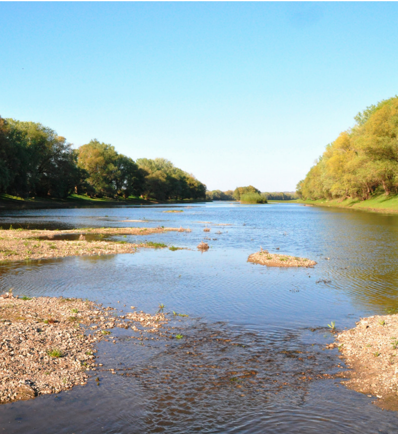
Dniester River branch near Coșnița village, Moldova, remains almost without water due to long-term summer drought. (Ilya Trombitsky.)