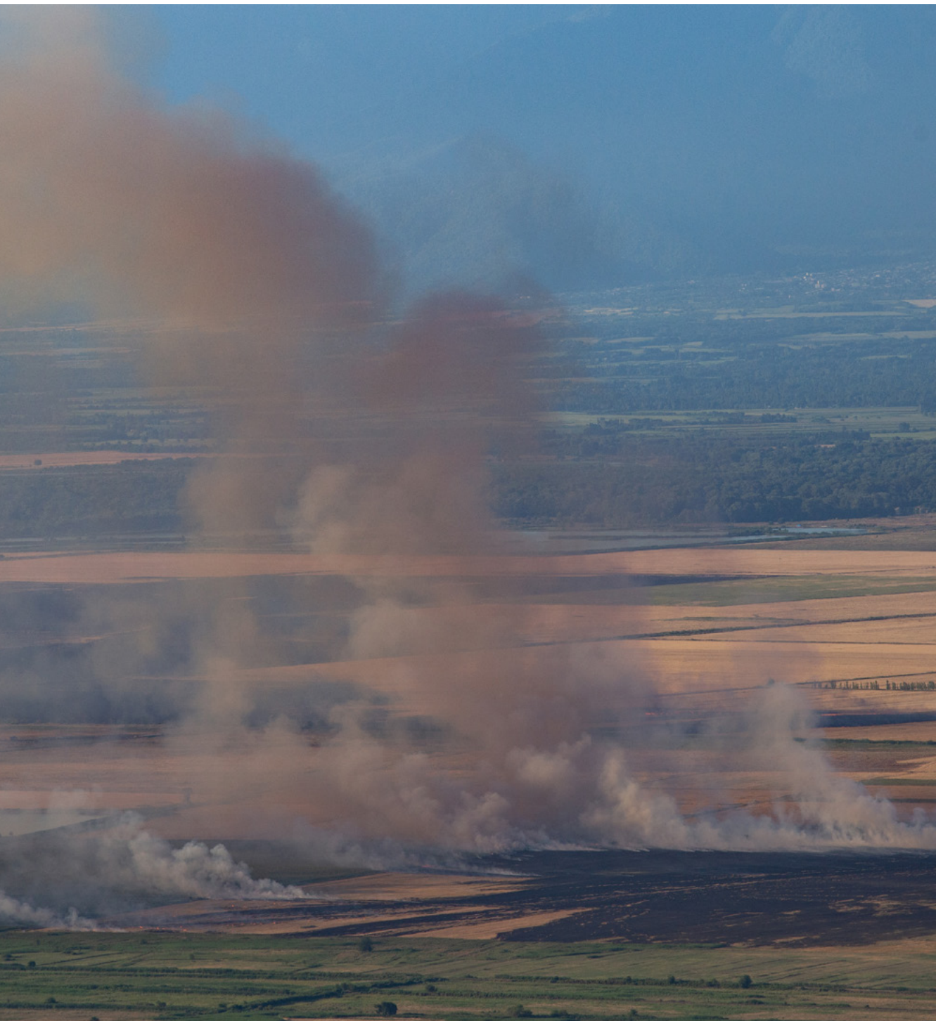
Agricultural fires in Dedplistskaro border region between Georgia and Azerbaijan. Agricultural burning is widely used to clear crop residue, eliminate pests and weeds. Climate change further aggravates the risks of spreading fires. (Teimuraz Popiashvili.)