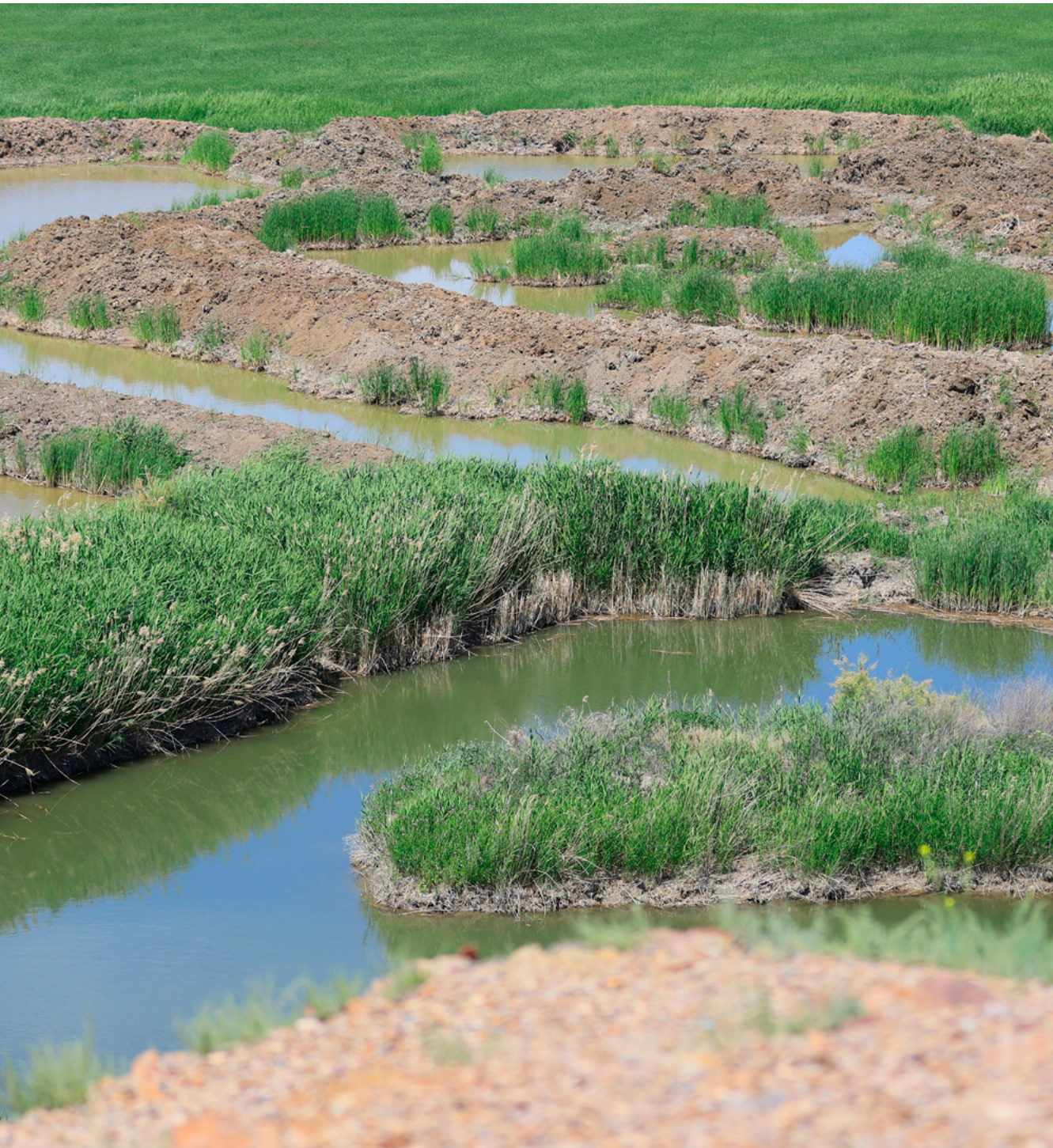
Khor Virap wetland, Armenia, endangered by climate change due to escalating evaporation and evapotranspiration. (Sergo Arakelyan.)