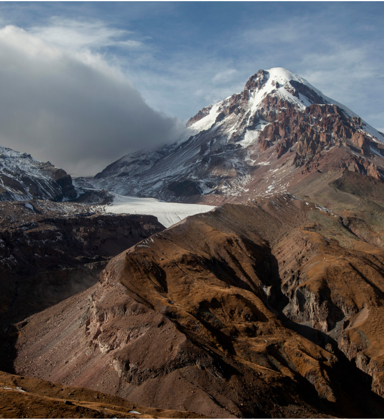
Mount Kazbegi, Mkinvartsveri, Georgia. Studies indicate a significant decrease in Caucasus glaciers as a result of climate change. (Nino Alavidze.)