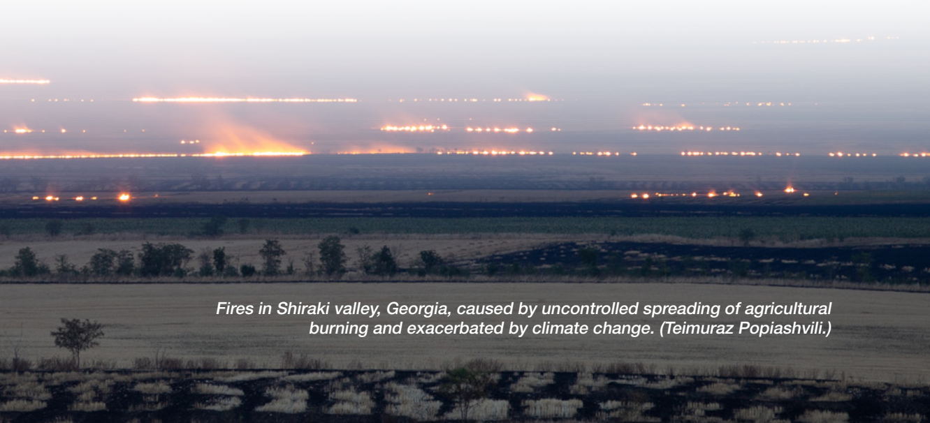
Fires in Shiraki valley, Georgia, caused by uncontrolled spreading of agricultural burning and exacerbated by climate change.