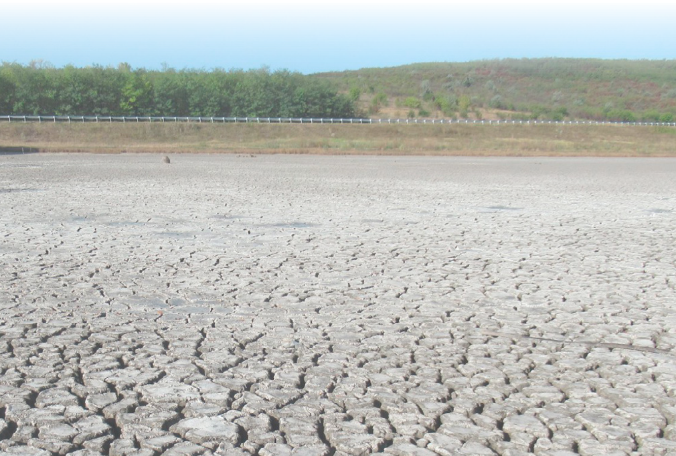
Dniester river tributary near Rădeni village, Moldova, remains without water due to long summer droughts and sub-basin deforestation. (Ilya Trombitsky.)

Water and Climate Change Adaptation in Transboundary Basins, UNECE 2015, available at https://unece.org/sites/default/files/2021-12/ece.mp_wat_45_eng.pdf